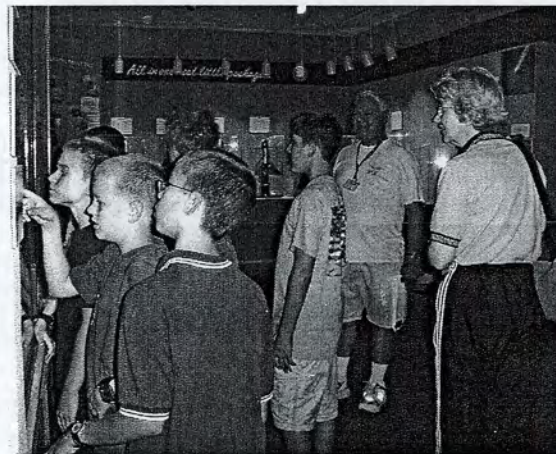
Students from the Murray School Aerospace Club tour the museum.