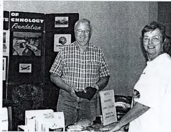
Your museum staff hard at work at the Verizon Community Dinner

With an eye toward the holiday season, the museum staff and members of the board have met to discuss the annual CLMF Christmas Party. Tentatively, this will occur the afternoon of 10 December 2003 at the museum so mark your calendar.