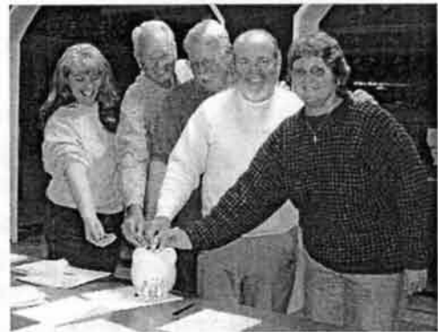
Board members contribute to the "piggy bank" which was auctioned off at the 3rd Annual CLMF Dinner/Auction

meeting reports on the status and plans of the Foundation, with reports from each of the functional areas of operations, fund raising, membership, public relations, and facilities. This year, the meeting will be held in the Museum at 1:00 PM on Friday, May 9, 2003. All CLMF members are invited to attend.