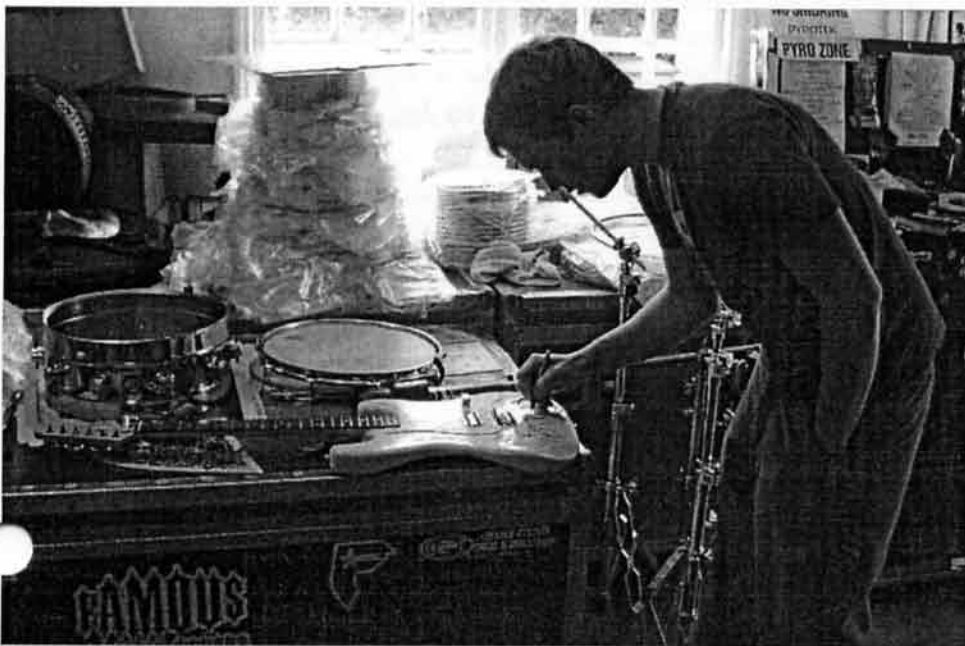
Mark Hoppus, of blink 182 , autographing the guitar that he generously donated to this year's auction.