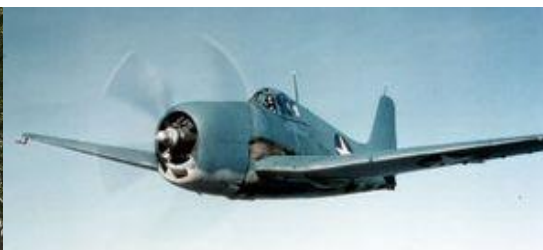
The U.S. Naval Museum of Armament and Technology