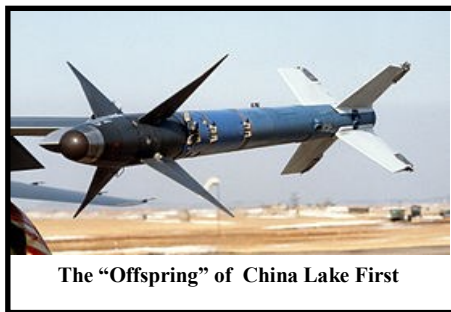
The "Offspring" of China Lake First

The theme this year is: China Lake's Firsts. With all that has been accomplished on the Base since 1942 you know there are a lot of firsts to explore. You may be surprised by some of the firsts that have been developed on-site.