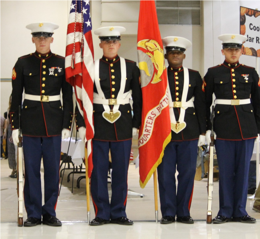
U S Marine Color Guard