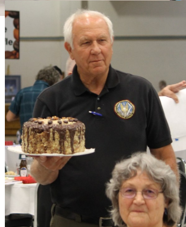
Yummy dessert donated by Cheryl Roquemore