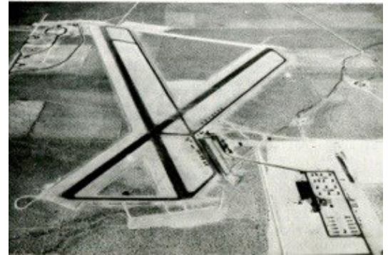
Inyokern Airfield, 1943

How did the airport get there and to whom did it belong? Trans-Sierra Airlines applied to establish a route from Fresno, California to Phoenix, Arizona in the mid 1930s. The Civil Aviation Authority (CAA) granted the request for an emergency landing field would be built in the Mojave Desert. Kern County purchased land and the CAA and the Works Project Agency (WPA)