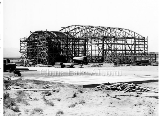
Kodiak Hangar Under Construction

By 1952 commercial passengers could fly from Kern County Airport #8 to Burbank for a fare of $5 each way on a DC-3, with a stewardess. The Navy's control tower at Inyokern was removed in 1959 and the hangar became the airport terminal. In 1985 the Indian Wells Valley Airport District was formed. By 1988 Skywest Airlines, UPS, FEDEX and others used the airport daily and many new facilities have been added.