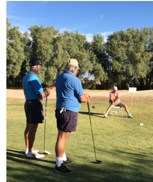
Crazy Fun! Join us at the 2017 Golf Tournament!

Thanks to our Hole Sponsors & Participants.