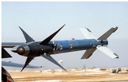
Sidewinder The "Offspring" of China Lake First

The theme this year is: China Lake's Firsts. With all that has been accomplished on the Base since 1943 you know there are a lot of firsts to explore. You may be surprised by some of the firsts that have been